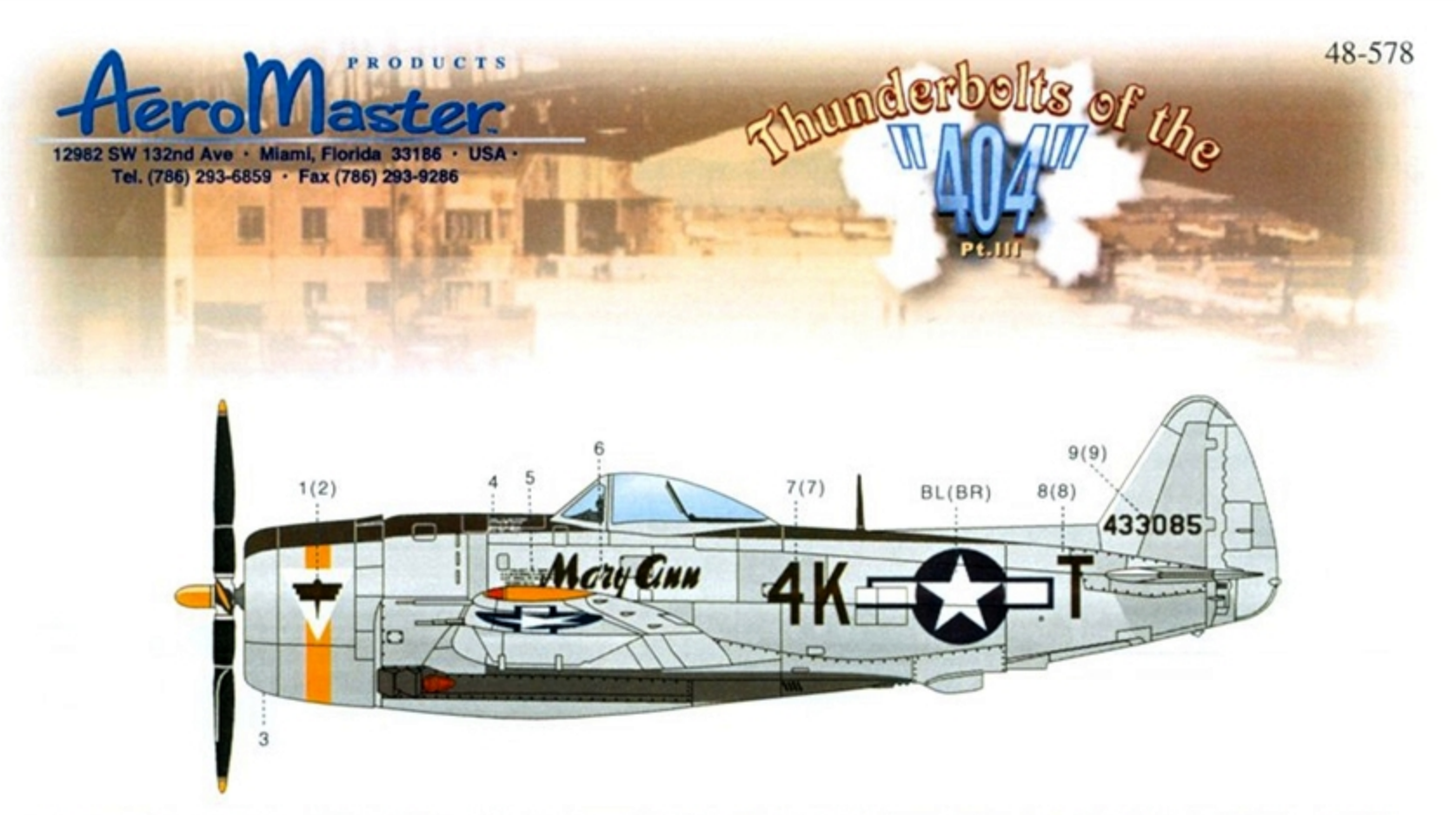
Aircraft 3 - P-47D-27-RE, 'Mary Ann' flown by Lt. Robert C. Meltvedt, 506FS, 404FG. Overall natural metal finish with Black antiglare panel. Prop hub Yellow. Black belly paint. C.E. Symmetrical paddle blade propeller.