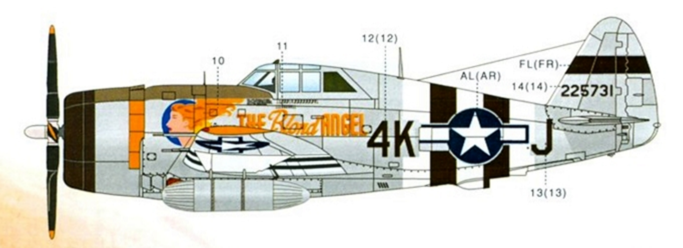
Aircraft 1 - P-47D-22-RE 'The Blond Angel', flown by Captain Thomas R. Litchfield, 506FS, 404FG. Overall natural metal finish with Olive Drab antiglare panel. Full invasion stripes on fuselage and wings. Early C. E. propeller. Black cowl front and stripes on tail surfaces. Yellow cowl flaps and wing tips. Note: apply decal 1 after painting antiglare panel, then trim to match.