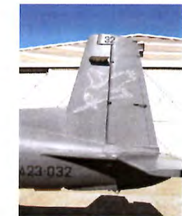
THE EYE IS OPTION ON THE 77 SQN PC-9